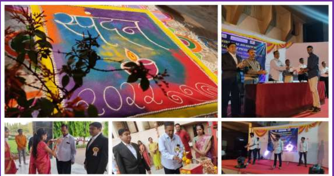
SPANDAN ANNUAL GATHERING

“All power is within you; you can do anything and everything” Swami Vivekananda