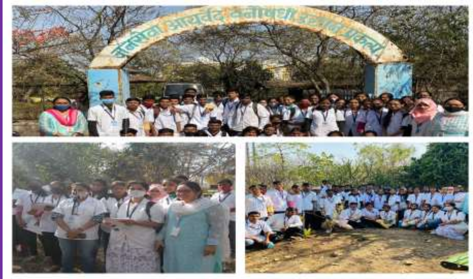
JANSEVA AYURVEDIC UDYAN, BHOSARI