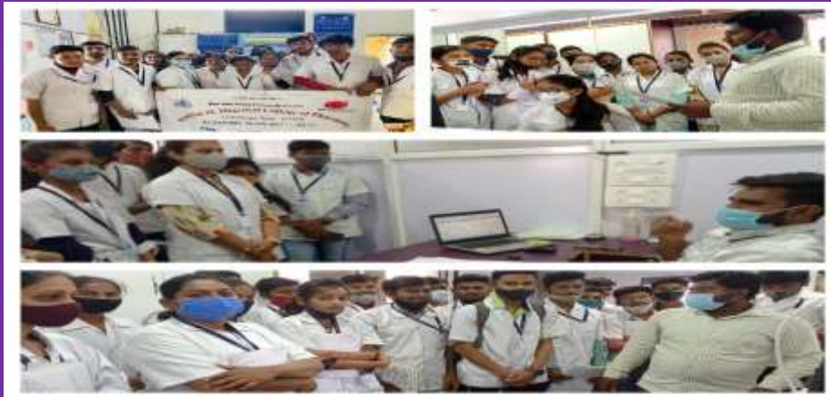
PRIMARY HEALTH CENTRE VISIT, AKURDI