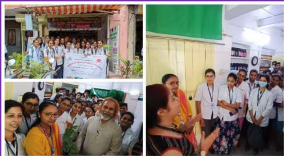
RAMRAS AYURVEDA CHIKITSALAYA, CHINCHWAD