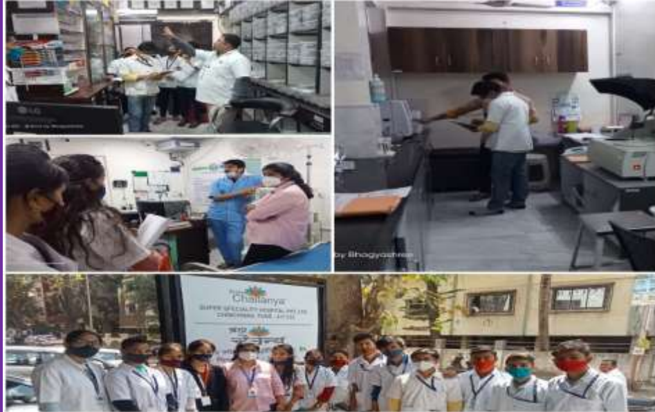
BRAMHCHAITANYA HOSPITAL ,CHINCHWAD